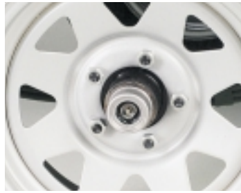
E-Z Lube Axle Offers convenient wheel bearing lubrication thru zerk fittings.