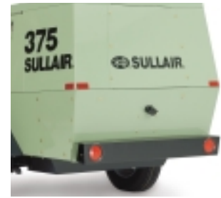
Rear Bumper Features recessed tail lights and license plate light.