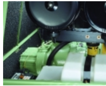
Rotary Screw Compressor Single-stage, fluid flooded. Cast iron housing is dimensionally stable, thick-walled and machined to close tolerances.